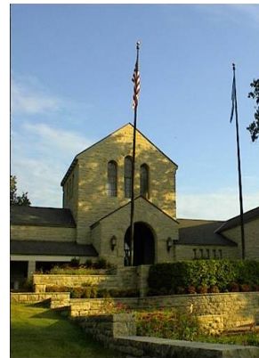
Will Rogers Memorial Museum