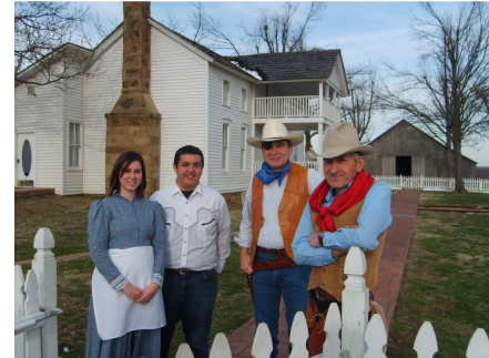
“Will Rogers” and cast members of Tumbleweed Productions, featuring Curly and Laurey from “Oklahoma!” Will Rogers Birthplace Ranch