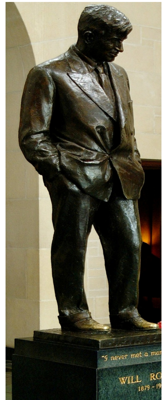
Will Rogers was known as the "Cherokee Kid"

Our local hoteliers offer two complimentary rooms (one for the driver, one for the escort) with 25 rooms booked. Attractions and local restaurants/catering also offer complimentary admissions, tours, and meals for the driver and escort with 20 or more in the group. All motor coach parking is free.