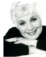
Shirley Jones The original Laurey Williams in the screen version of Oklahoma!