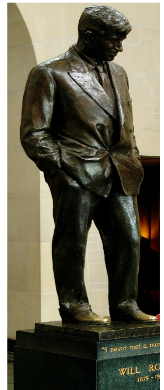
Will Rogers was known as the “ Cherokee Kid ”