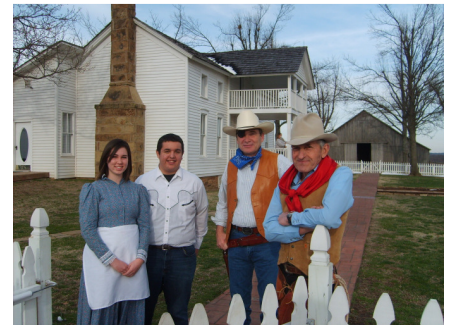
“Will Rogers” and cast members of Tumbleweed Productions, featuring Curly and Laurey from “Oklahoma!” Will Rogers Birthplace Ranch