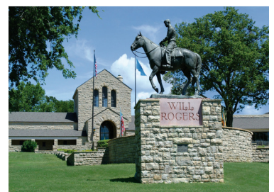
Will Rogers Memorial Museum

More options: gaming at the Cherokee Casino Will Rogers Downs or Hard Rock, Tulsa; shopping in Claremore's Historic Downtown; visit area Route 66 icons such as the Blue Whale or the world's largest Totem Pole, enjoy great entertainment at the Robson PAC or see Rodgers and Hammerstein's "Oklahoma!" at Discoveryland (summer only)