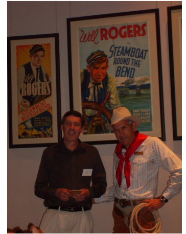
Free Roping lessons if you are willing!

Tom was known as the “King of the Cowboys”, the original good guy in the white hat. Galloping across the silent screen on his horse, Tony, he rescued damsels, lassoed villains and performed death-defying feats of bravery. The museum displays his costumes, memorabilia, photographs and some of his personal property; in addition some of his silent movies can be seen in the museum’s theatre. (Allow 1 hour)